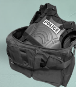
Included Gear Bag