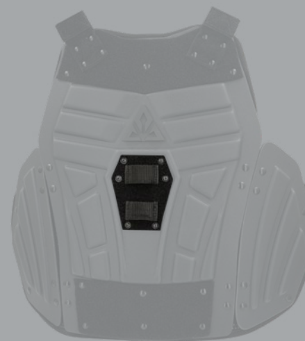
Shown on the PX6 Tactical Riot Suit