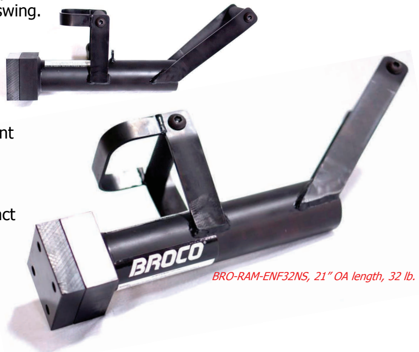
BRO-RAM-ENF32NS, 21" OA length, 32 lb.

Broco Enforcer rams have been NTOA Member Tested and Recommended!